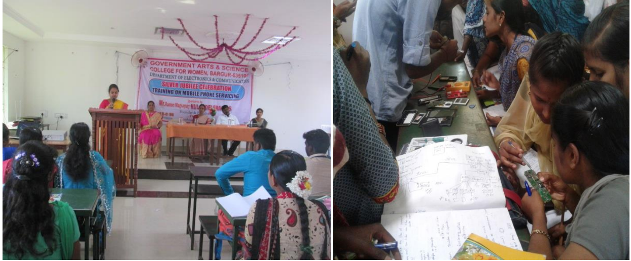
Hands on Training Mobile Servicing